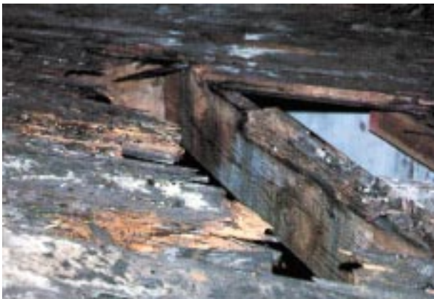
Fig. 1. Beetle damaged floor.

Cultural control —Anobiid beetles thrive best in wood when moisture content ranges between 14%