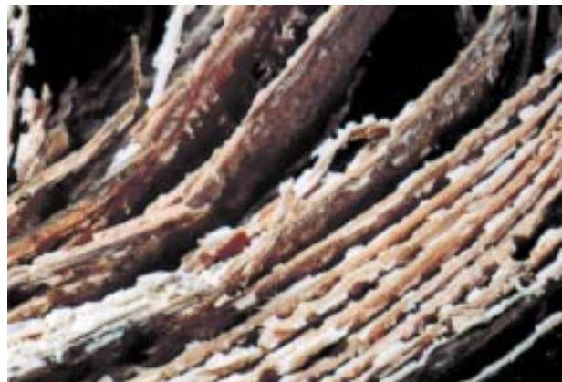
Fig. 2. Infested plywood.

Tenting and fumigating is becoming more widespread as a means to control many insects. For the most part, fumigations can effectively eliminate pest insects from a structure. However, this procedure will not prevent reinfestations. Fumigations are not recommended due to their high cost and lack of lasting (residual) protection. An overall program that reduces